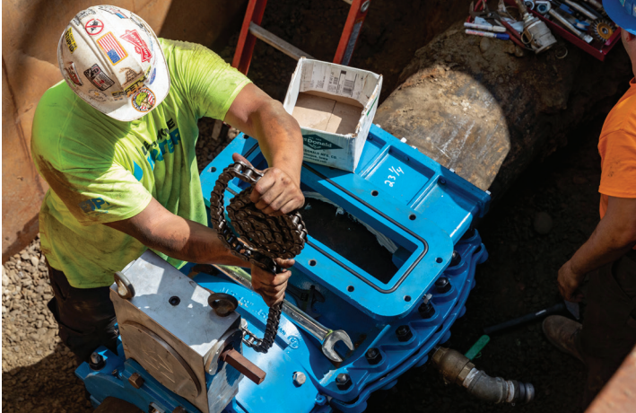
The end rings were installed to hold the gear box.