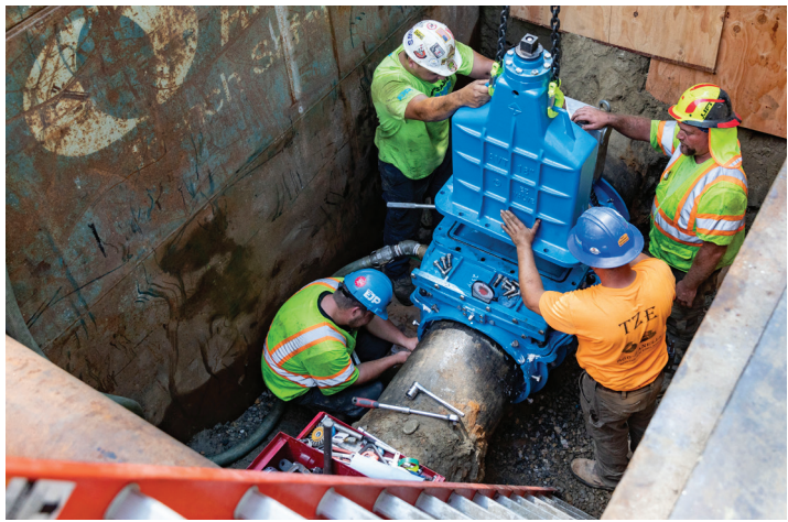
The bonnet wedge was then greased before being lowered into the excavation and fitted to the valve body.