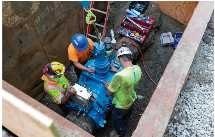
The EM (end milling) machine was installed into the top of the valve.