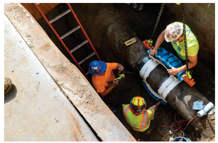
The valve parts were fit together, lowered to the pipe, and set in place.