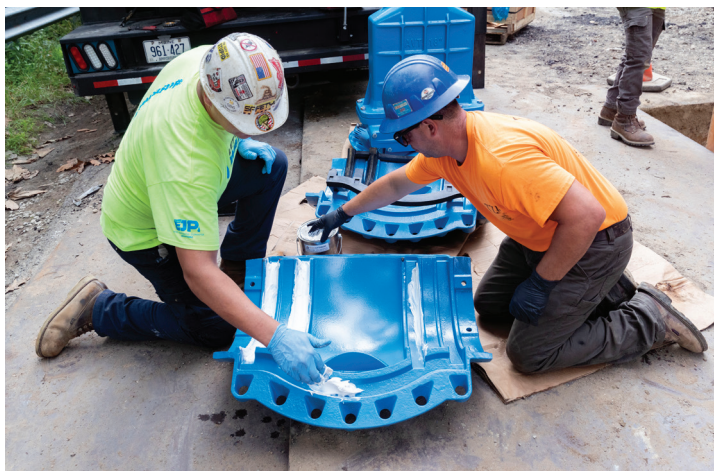
The valve gasket was placed on the pipe to enable its final position to be marked. The pipe was taped, and grease applied to the pipe and gasket which was in place on the valve body.