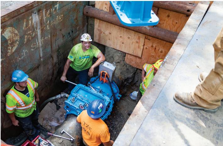
Once connected to the power the EM machine was rotated 120° around the pipe to form a slot which would hold the resilient wedge gate. The isolation gate was closed, and the EM machine removed.