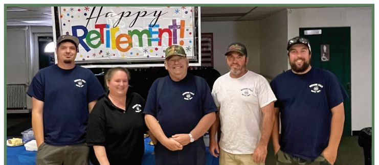
Mechanic Falls Crew