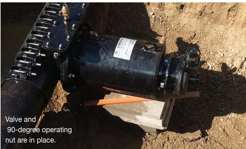
Valve and 90-degree operating nut are in place.