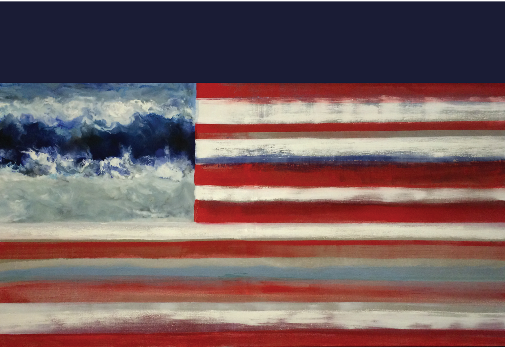
From Sea to Shining Sea II, Ruth Hamill

PRSRT STD U.S. POSTAGE PAID Portland, ME Permit No. 380