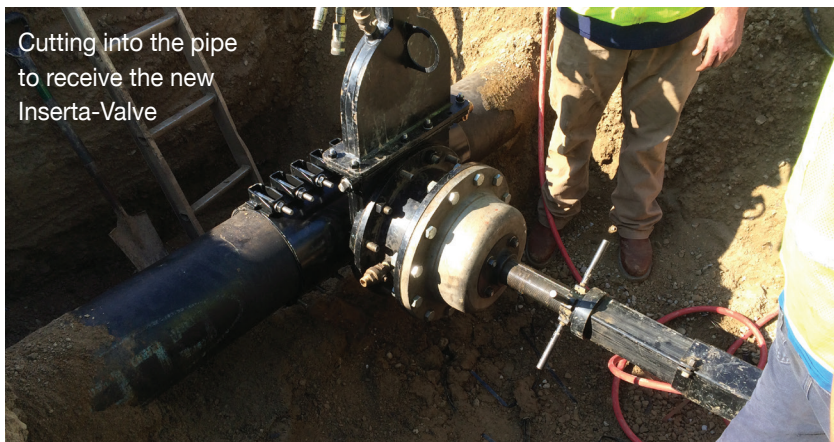
Cutting into the pipe to receive the new Inserta-Valve

For more information about the services Team EJ Prescott can perform to help out your system, contact your local sales representative.