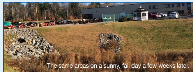
The same areas on a sunny, fall day a few weeks later.

Team EJP prides itself on offering effective solutions to our customers. It's gratifying to show that we use those same solutions in-house as well!