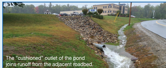
The "cushioned" outlet of the pond joins runoff from the adjacent roadbed.

On September 30, 2015, a large weather system dumped over 5 inches of rain across the State of Maine in a very short period of time. This downpour tested the runoff retention system at Team EJP's home office as it has never been tested before.