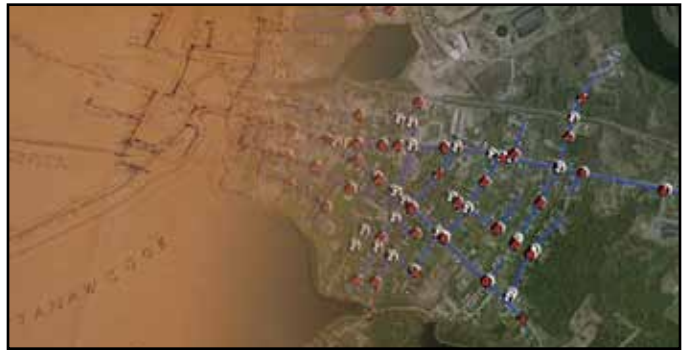
A transitional map of Lincoln, ME 1950 to 2008 with G.I.S.

The Geographic Information System (GIS) is an innovative method of tracking underground infrastructure utilizing new technology now available from TEAM EJP. GIS is a system designed to retrieve, analyze, store and display geographic data