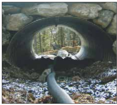
Finished site at Camp Hi-Rock in Mt. Washington, MA.