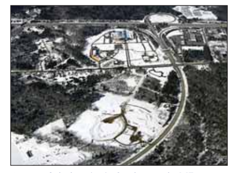
35-acre Cabela's site in Scarborough, ME.

We all know that Team EJP knows water. What some people may not know is that when it comes to moving that water through sensitive areas, EJP is on the