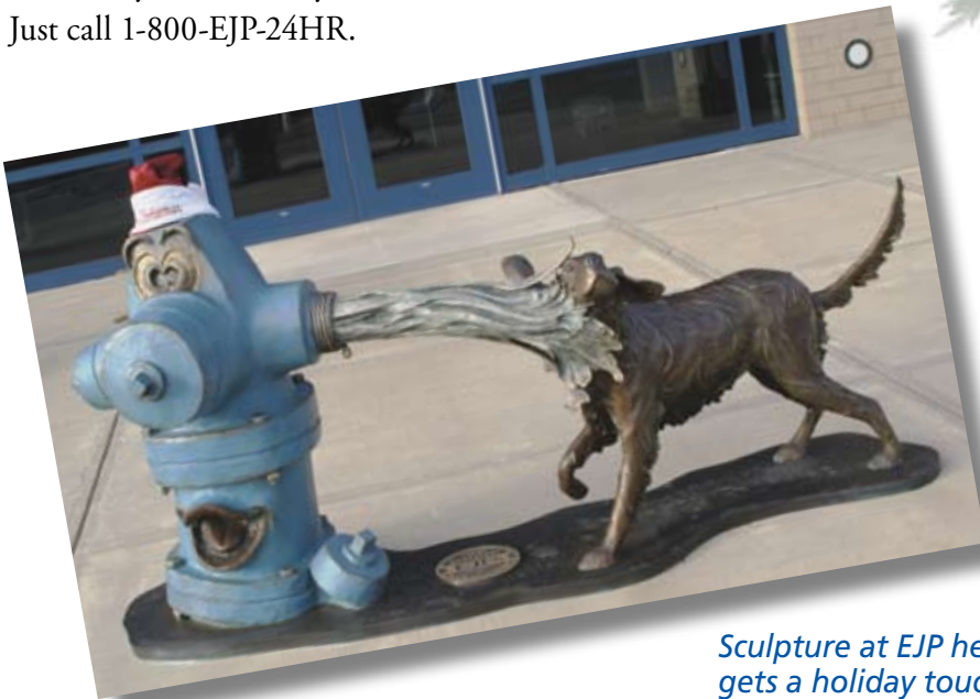
Sculpture at EJP headquarters gets a holiday touch...

All TEAM EJP locations will be closed on December 24th, December 25th, and January 1. We will be open for business on December 26 and 31. Of course, in case of emergency, we'll always be here for you 24/7. Just call 1-800-EJP-24HR.