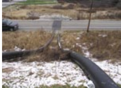
This quickly assembled drainage system kept flood waters away from Bowdoin Central School

On Wednesday evening, October 25, Team EJP Gardiner received a call from the Maine Department of Transportation (MDOT) with an alert about an earth dam breach in the Town of Bowdoin. The dam is approximately 35 feet high and spans three football fields, and is located directly across from the Bowdoin Central School. At the time of the call, approximately 15 acres of water, 15 feet deep, had collected behind the dam.