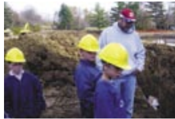
Cub Scout Pack 183 gets an up close look at waterworks engineering in action.