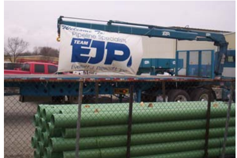
Great weather and great information abound at the Team EJP Wabash Open House.