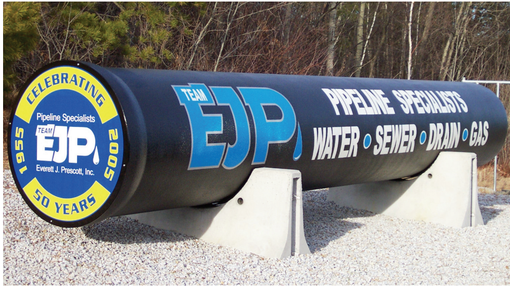
The new "pipe sign" outside Team EJP Concord welcomes visitors in grand style.