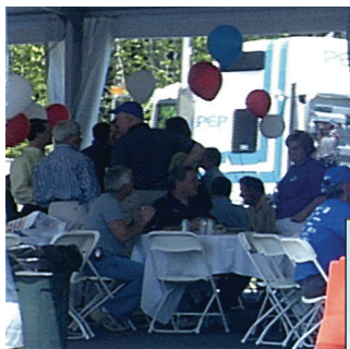
Above: Good food and good times abound at the Home Office Open House. Right: EJP's Home Office stands ready to welcome customers and vendors.

The day couldn't have been better and all of us at the home office thank everyone who attended.