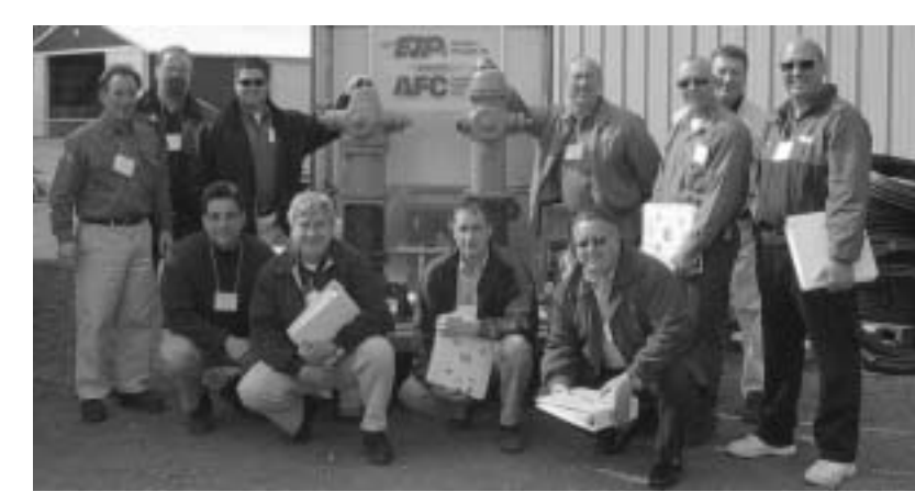
One of the four groups getting specialized training.