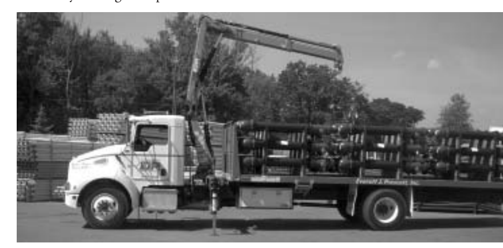
Hydrants seen here were purchased by Merritt Construction for their Town of Ulster, NY project

Our newest trucks may be no match for the Team EJP Racing Truck, but our customers are not complaining. Rigged with cranes that enable lengths of ductile iron pipe to be strung at the job site, our 10 new trucks are the latest example of how we are constantly striving to improve service to our customers.