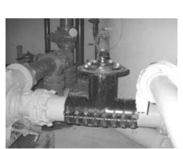
Photos above: Valve insertions for the village of Franklinville, NY. "Buffalo" Bob Gingerich is above right. Photo at right: Valve insertion for the town of Canadea, NY's Waste Water Treatment Plant.