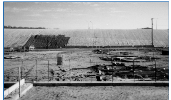
The Rhode Island Division and PEP Transportation teamed up to supply RAM Construction with North American Green erosion control materials needed to stabilize this hill behind the Newport Mall.

With just a click, it was determined the project called for 10,000 square yards of Sciso photodegradable blanket, and 10,000 square yards of C125 long-term coconut fiber. With the help of PEP Transportation, the materials were delivered from Evansville, IN, and installed within a week and a half.