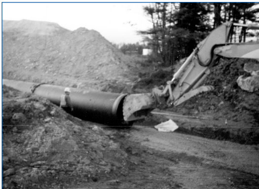
The Maine Turnpike Authority, R.J. Grondin, Woodward & Curran and Team EJP teamed up to reroute the 42" transmission main feeding the city of Portland from Sebago Lake.

This very technical project required close cooperation among all parties. EJP would like to congratulate and thank all involved for their help in completing this exciting and demanding project successfully.