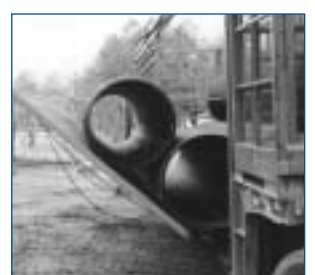
HDPE arriving at jobsite