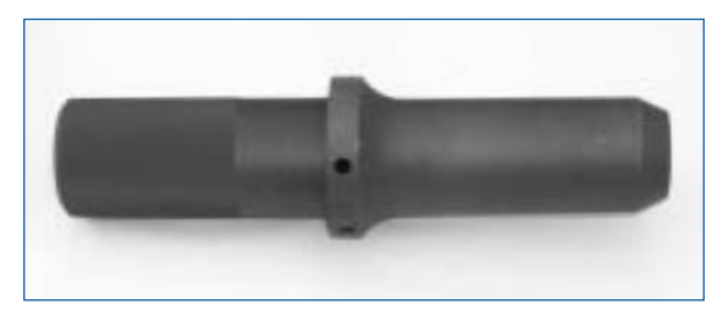
Combo Rounding & Flare Tool

The tubing end has been extended for better rounding, and it has been bored out to reduce weight. Machined pressure-