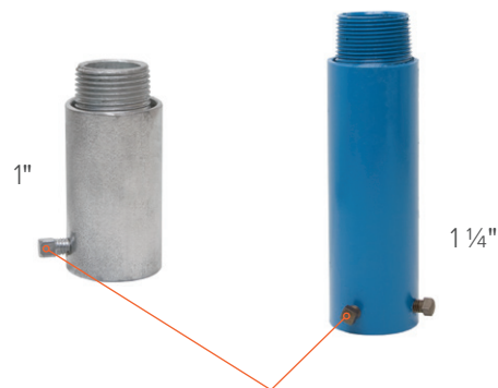
5/16" hardened, square head, cup point set screws for extra holding power and adjustability

Our service box extensions are made from Schedule 40 pipe and are used to increase the height of an existing service box or to accommodate greater depth in a new installation. The service box extension is installed by removing the existing cover and sliding the extension over the top of the box pipe. The extension is adjusted to the desired height and the set screw(s) are tightened to lock it in place before replacing the cover. Extensions are made in lengths from 3" to 24".