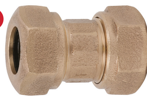
Red Hed Compression x Compression Coupling RH Page 8