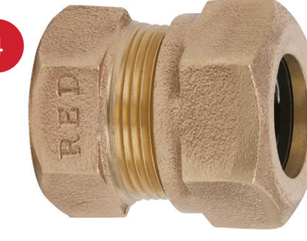
Red Hed Female x Compression Adaptor RH Page 7